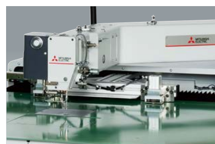
Easy maintenance! New arm-shaped, glass epoxy slide plate