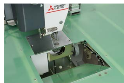
The bobbin can be replaced from the top